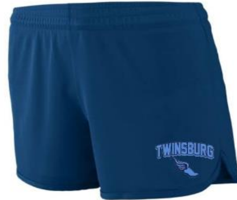
03.) RBC Cross Country 357 Ladies Accelerate Shorts *Required Uniform*