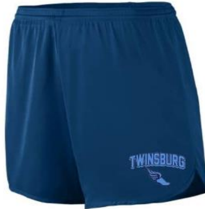
02.) RBC Cross Country 355 Accelerate Shorts *Required Uniform*