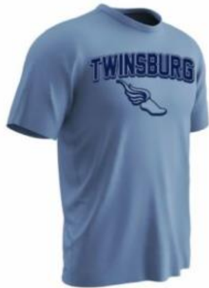
01.) RBC Cross Country BST99 S/S Dri-Fit Vision T-Shirt Jersey *Required Uniform*